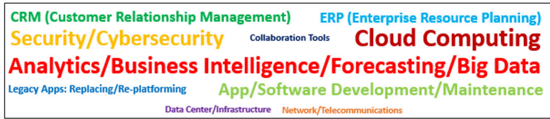
Figure 2: Top-Five Most Important and Worrisome IT Management Issues

n = most senior IT leader in 624 unique organizations